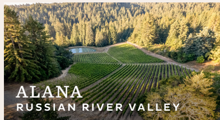
ALANA RUSSIAN RIVER VALLEY

Our Monopole Vineyards are sites that were selected, designed, and built by us; for us. They were chosen for all aspects of terroir and natural influence and have epitomized the selective and inspired vineyard development processes. The Alana, One Sky, and William James Vineyards are smaller and younger than their Heritage counterparts, but they are equally as mighty. Dedicated solely to Three Sticks production and farmed organically, they have already proven themselves as sites capable of expressive, extraordinary wines. Their future is extremely bright, and we look forward to sharing every glass of it with you.