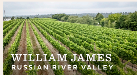
WILLIAM JAMES RUSSIAN RIVER VALLEY