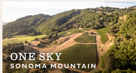
ONE SKY SONOMA MOUNTAIN