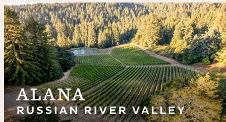
ALANA RUSSIAN RIVER VALLEY

Our Monopole Vineyards are sites that were selected, designed, and built by us; for us. They were chosen for all aspects of terroir and natural influence and have epitomized the selective and inspired vineyard development processes. The Alana, One Sky, and William James Vineyards are smaller and younger than their Heritage counterparts, but they are equally as mighty. Dedicated solely to Three Sticks production and farmed organically, they have already proven themselves as sites capable of expressive, extraordinary wines. Their future is extremely bright, and we look forward to sharing every glass of it with you.