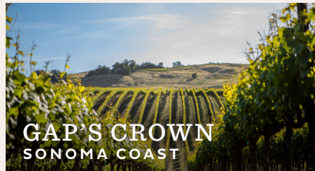
GAP'S CROWN SONOMA COAST