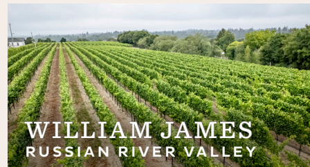
WILLIAM JAMES RUSSIAN RIVER VALLEY