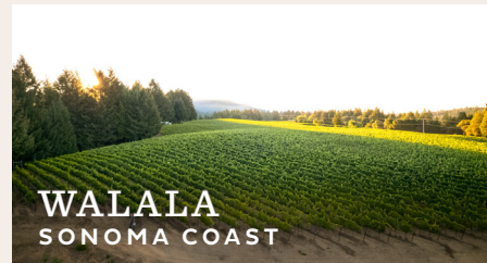
WALALA SONOMA COAST