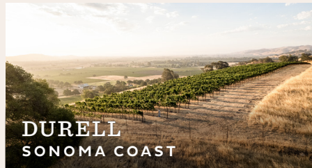
DURELL SONOMA COAST

The Durell, Gap's Crown, and Walala Vineyards comprise what we call our Heritage Vineyards. We recognize and celebrate the history and legacy of these renowned vineyards even prior to our ownership of them. But, as their current stewards, we take very seriously our responsibility to create and protect their future. We do so with obsessive attention to detail and meticulous care in farming them. These Heritage Vineyards are, and forever will be, cornerstones of our fine chardonnay and pinot noir production. Three Sticks, among a select group of other producers, will create and share wines from these iconic vineyards for many years to come.